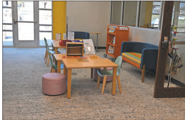
The library includes a bright seating and activity area for small children.