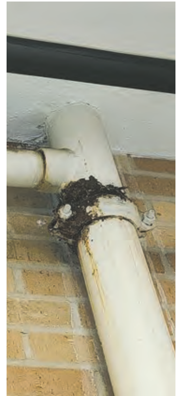
KCPS are dealing with overcrowding conditions at many schools; as an example, the auditorium stage at East High is being used as a testing center. There is also a major need for infrastructure repair and maintenance.