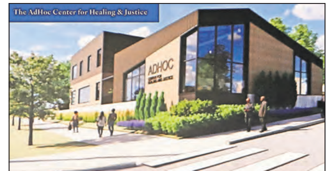
A rendering of the exterior of the Ad Hoc Center for Healing and Justice viewed from Benton Blvd.

about 700 families annually through its healing and justice-focused programs. The organization hopes the new facility will allow them to help many more families each year by expanding their services directly in the communities most affected by violence.