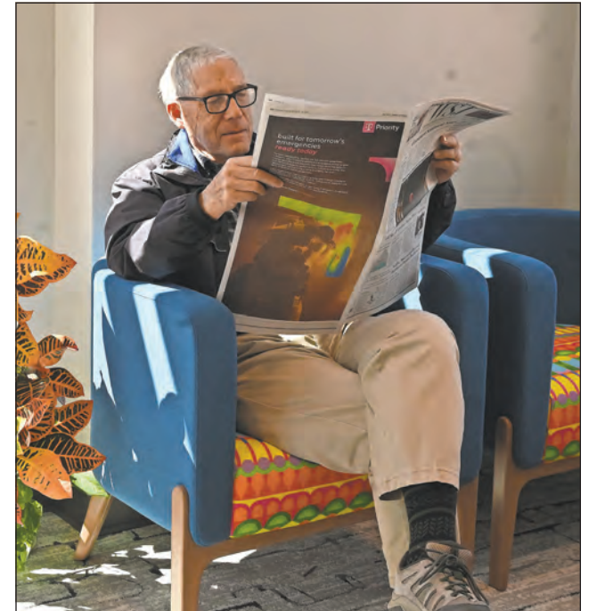
The remodel included the addition a small addition on the west side of the building with lots of windows. The room is furnished with comfortable upholstered furniture.

TODAY is for tackling your next big project.