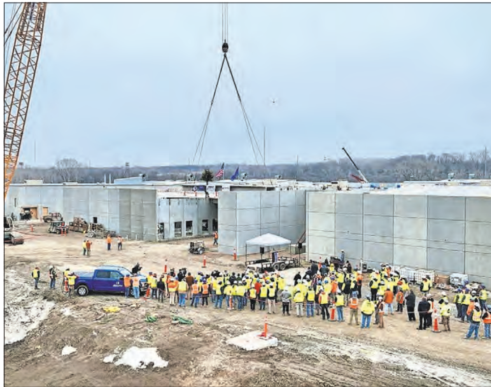
A new $301 million, 1,000-bed Jackson County jail currently under construction is expected to be operable later this year. KCMO opted to construct a separate facility citing the needs for their detainees to have services focused on stabilization and reentry support.

Mayor Quinton Lucas backs the renewal, calling it part of a comprehensive approach to public safety. The Greater Kansas City Chamber of Commerce and the Civic Council of Greater Kansas City have endorsed the measure.