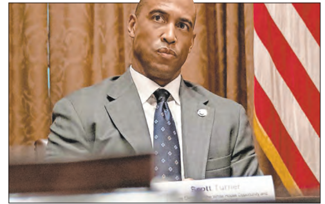
Scott Turner, a former football player and elected official in Texas, also served in President Trump's first administration. He has a reputation for community advocacy and for helping the underserved.

After retiring from the NFL, Turner shifted his focus to public service, becoming a leading advocate for community development and economic empowerment. He founded several initiatives aimed at improving access to education, housing, and job opportunities in underserved communities. Turner's approach emphasized collaboration among local governments, nonprofits, and private