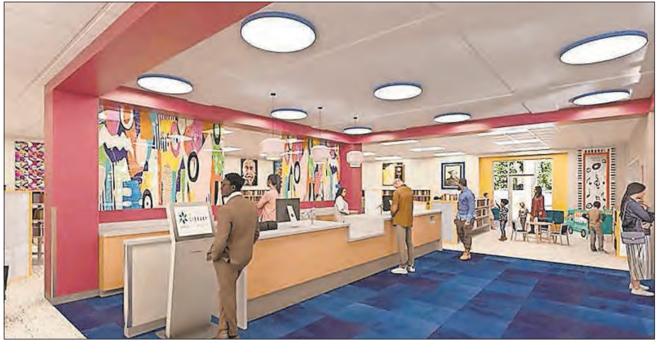
Rendering of inside of renovated and expanded Maya Angelou Branch Library.